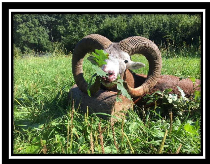
A nice ram hunted during hunting season 2016

16000 HECTARES FREE RANGE IN SOUTHERN SLOVAKIA