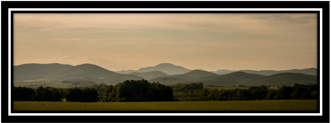
A view of hunting area