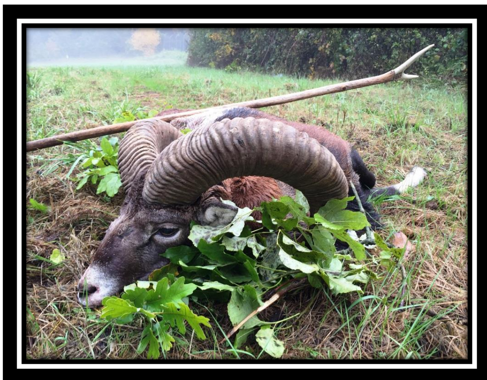
A mouflon ram hunted in 2016